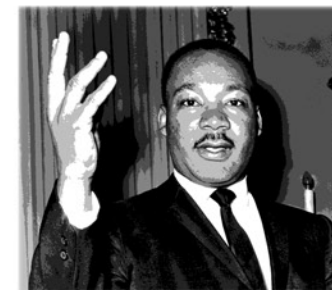
Martin Luther King Jr., American clergyman and civil rights leader

“How can the dream survive if we murder the children? Every aborted baby is like a slave in the womb of his or her mother. The mother decides his or her fate.”