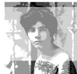
Alice Paul American suffragist, feminist and women's rights activist

“Abortion is the ultimate exploitation of women.”